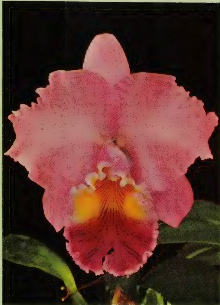
Cattleya Heyday, variety Colossus Cross No. 3452